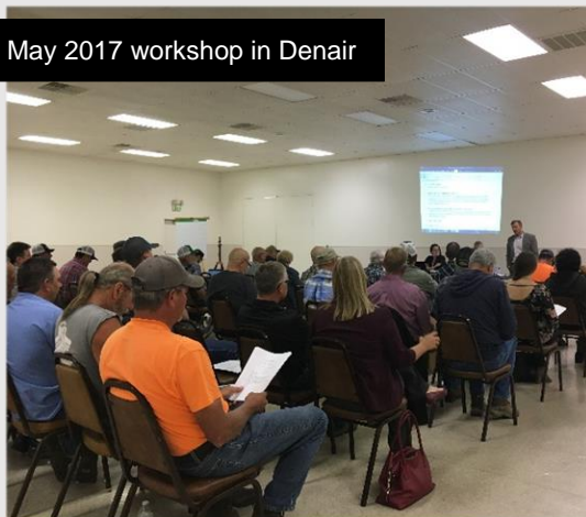
May 2017 workshop in Denair